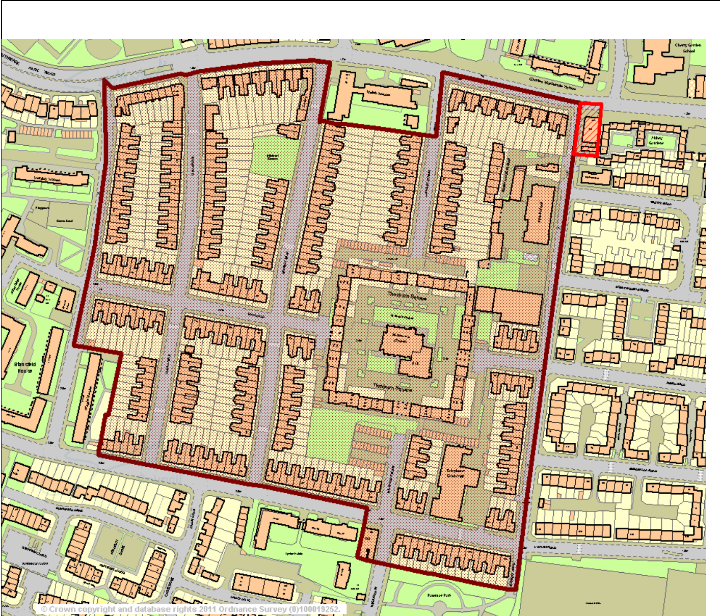
Thorburn Square Conservation Area and 2012 extension