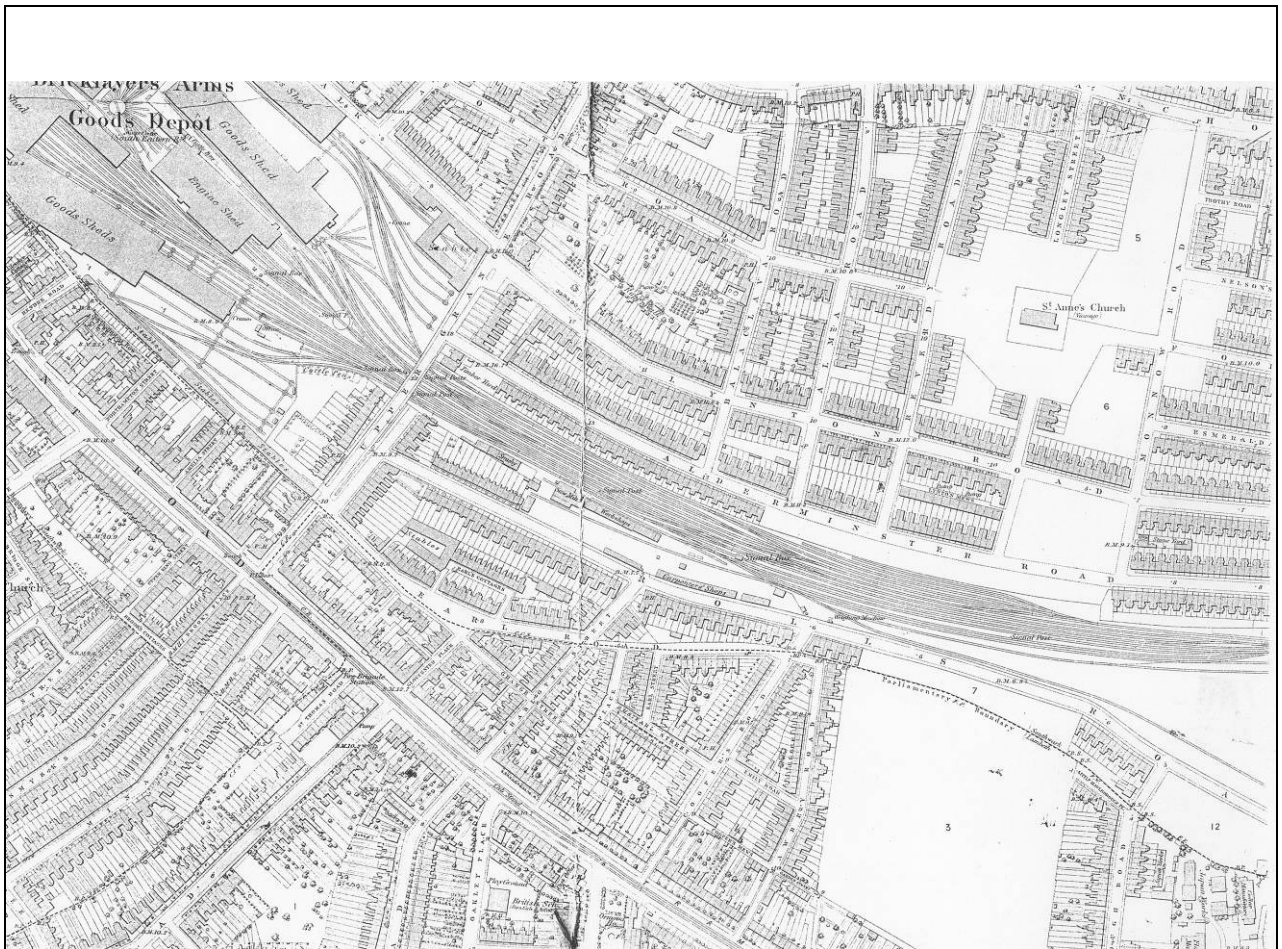
Thorburn Square c.1850-51

1.8.2 Information on the Southwark Plan, including electronic versions of the plan and supplementary planning guidance, can be found on the Council's web site at www.southwark.gov.uk .